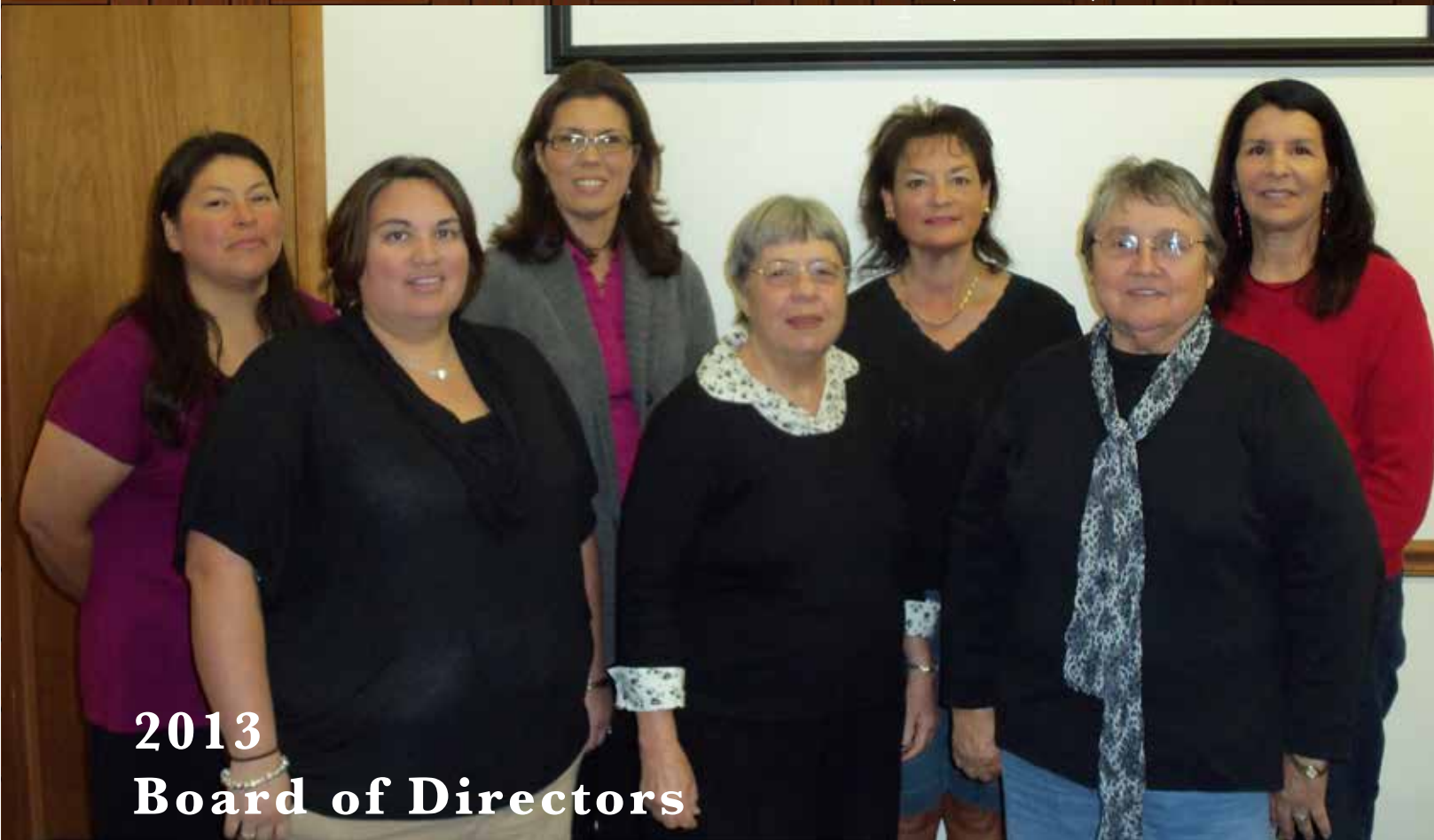
2013 Board of Directors